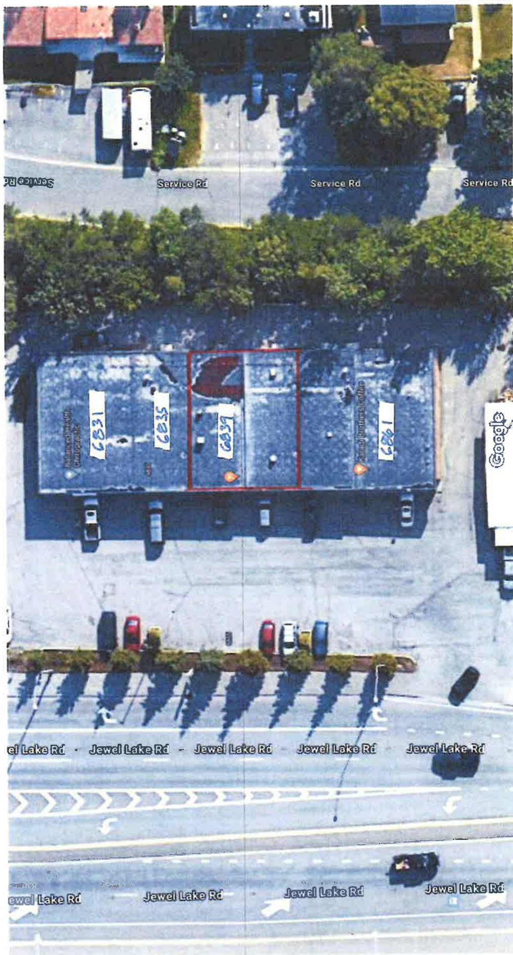
20 ft